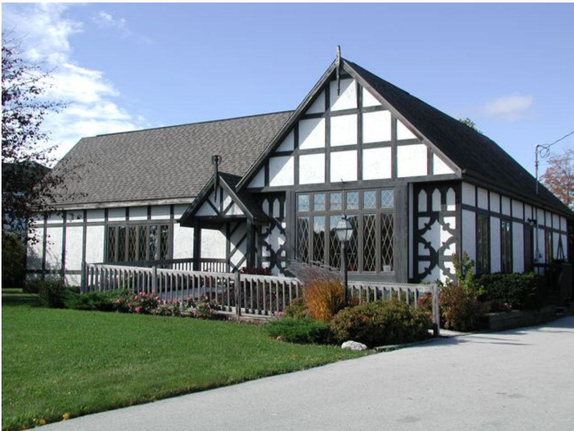
269 Koessl Lane, Sister Bay

The building was later used as a hair salon and is currently used as a church. It is handicapped accessible.